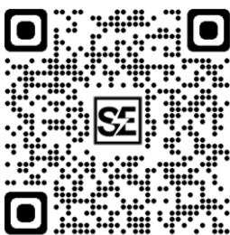
Scan QR Code For More Information